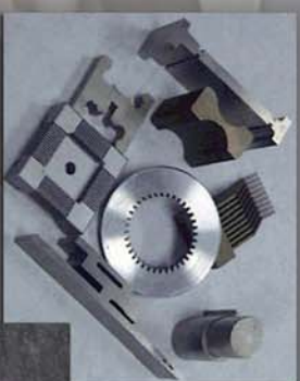
Wire EDM Samples