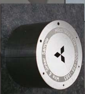
Wire EDM, CNC Sinker and Hole Pop Sample